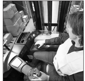
Spacious, comfortable cabin