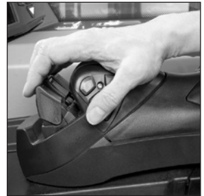
Ergonomic armrest controls