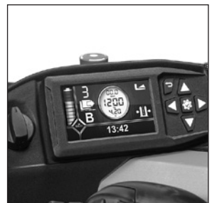
Clear, informative display